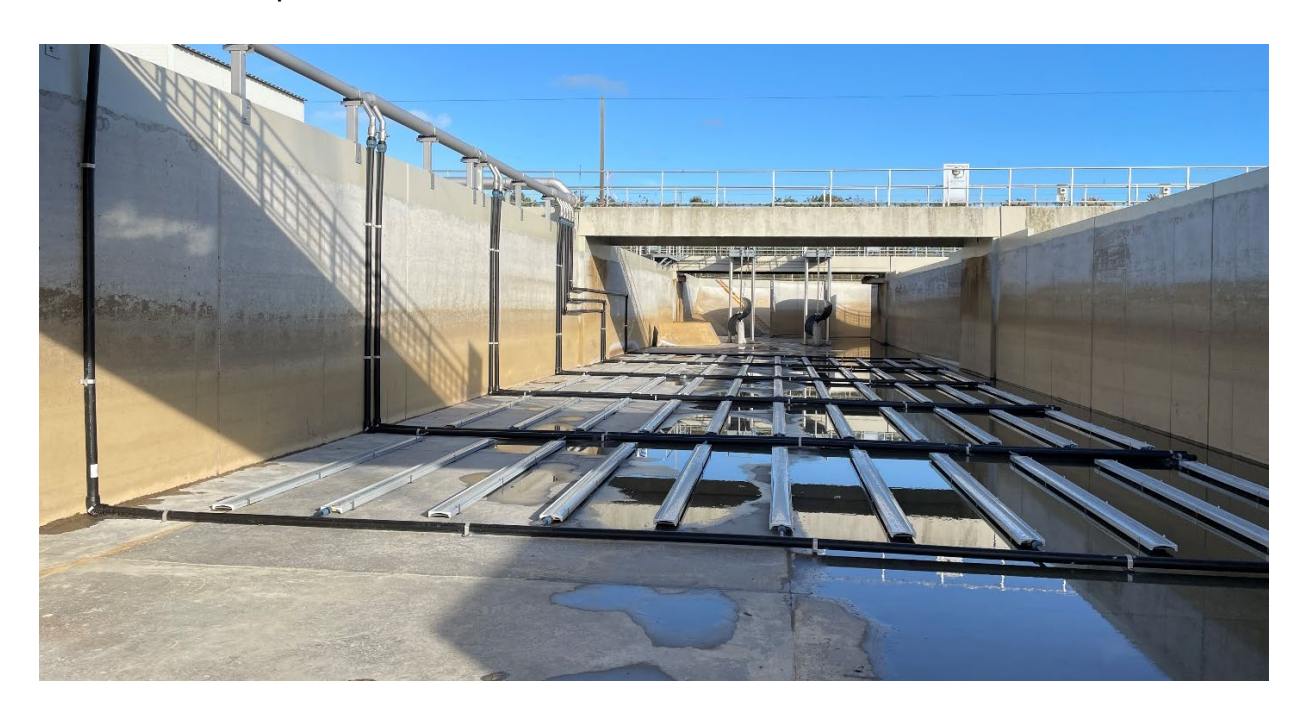
Egsmade RA (Svendborg 2023-24)

Here are a few examples of projects where BioMizing has designed, delivered and installed Aerostrip diffusers.