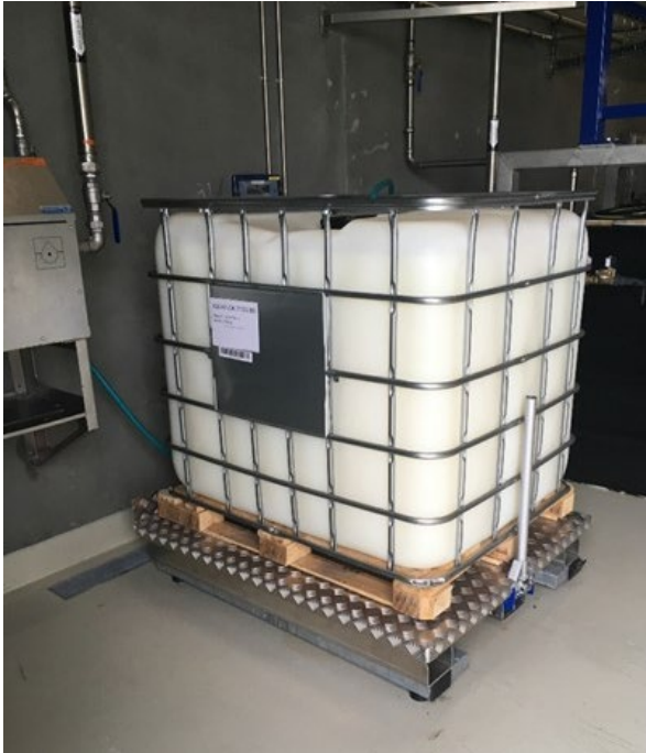
BM-Tilt with pallet tank