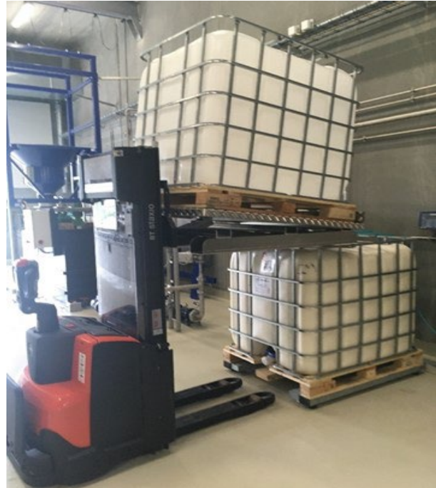
BM-Tilt handled with stacks