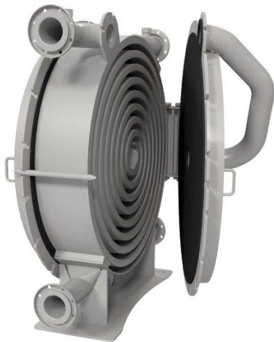
Exchanger with a open lid