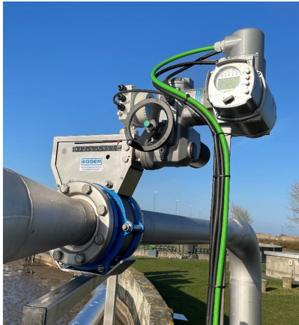
Iris valve mounted at Nakskov RA

Maintenance free The Iris valve is supplied with a spindle in acid resistant steel and a spindle nut in the composite material PEEK.