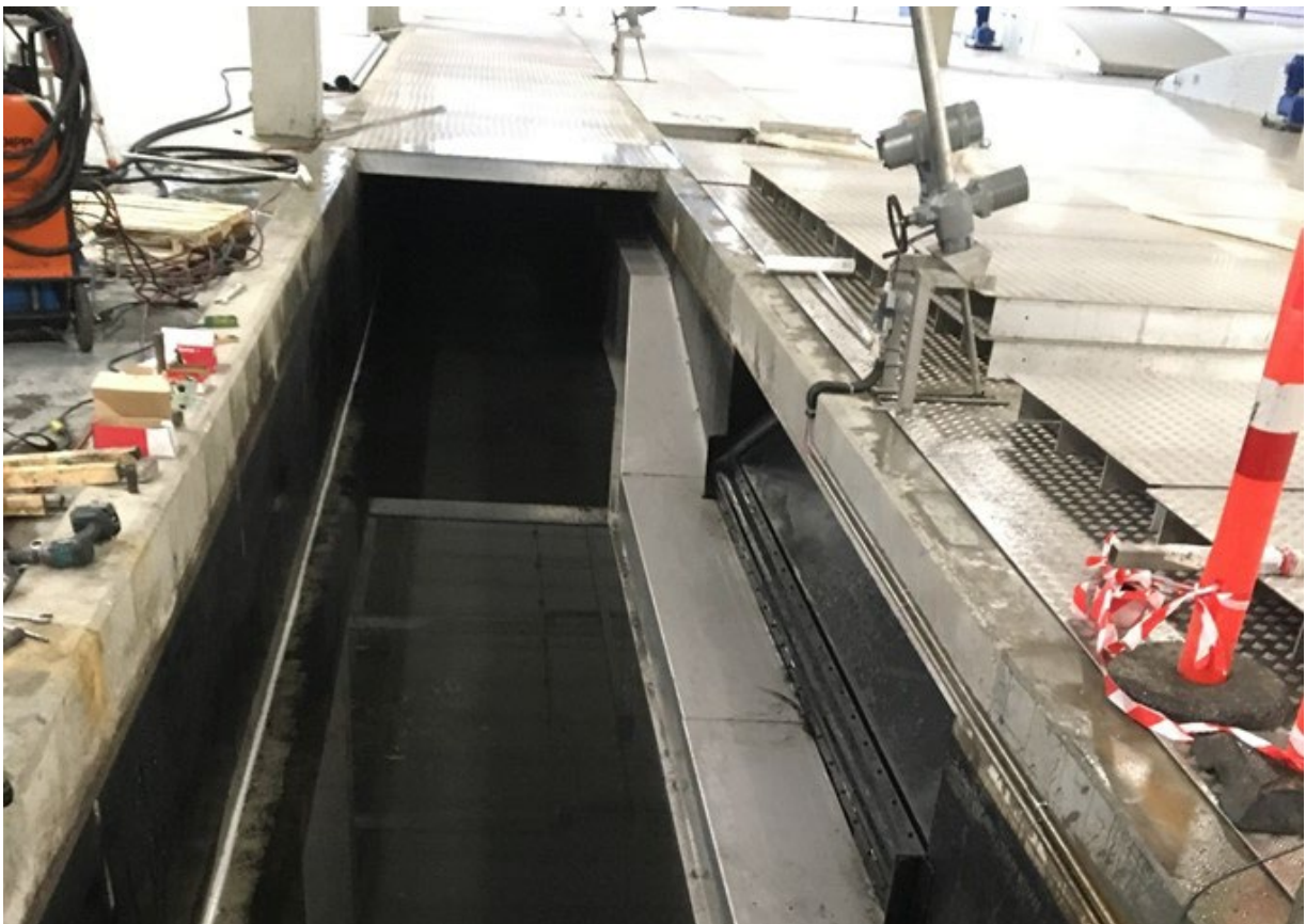
Reconstruction of the return sludge channel in the inflow channel.