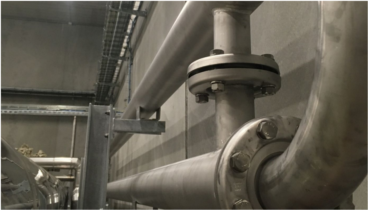
Extra sludge/water exchanger (BioMizing BM-PPH)