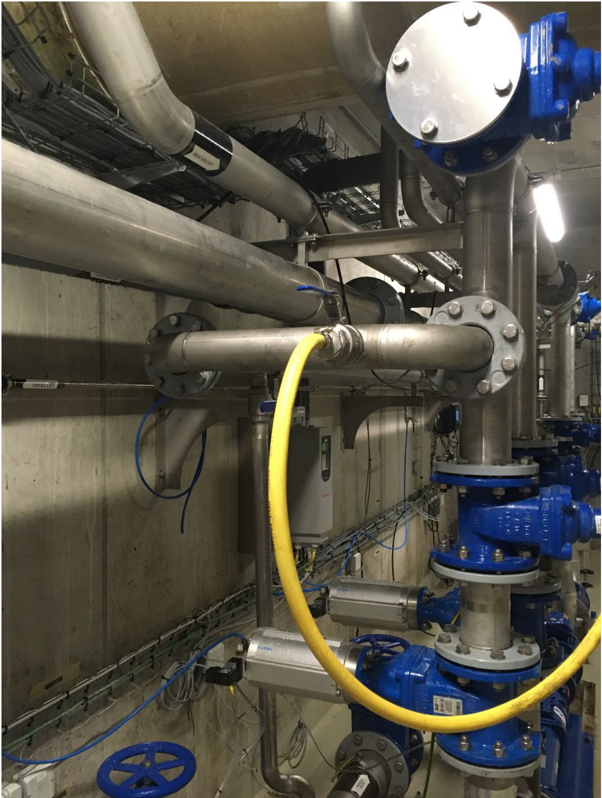
New pipe system for pumping primary sludge (from Salsnes Filter)