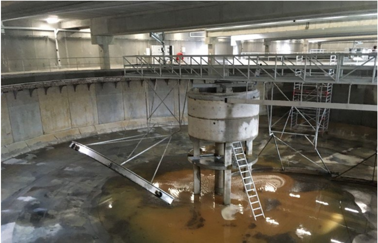
Reconstruction of post-clarification tanks, with new floating sludge scrapers and outlets