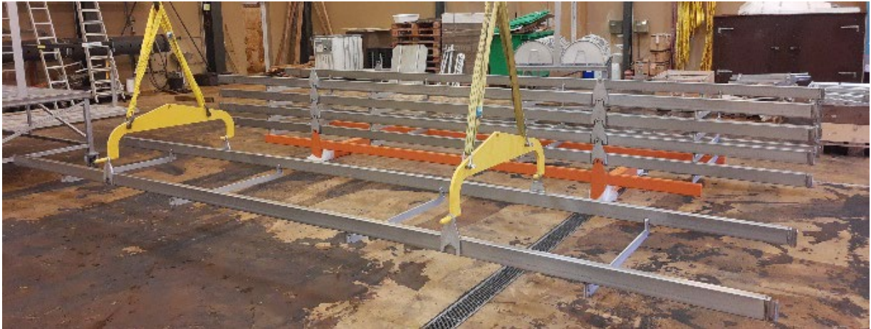
A frame is lifted